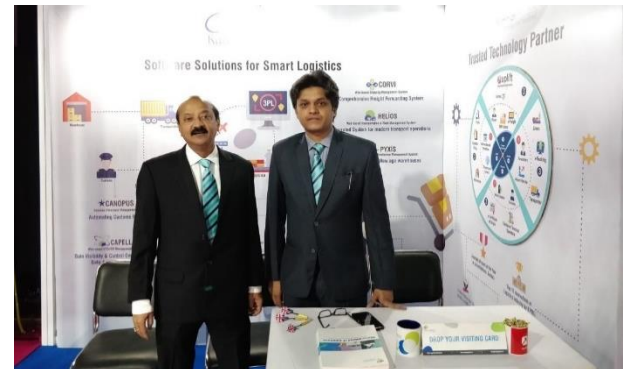
FIATA World Congress New Delhi, India 26-29 September, 2018