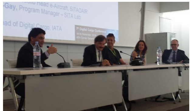
IATA 7th Digital Cargo Conference Geneva, Switzerland 18-19 September, 2018