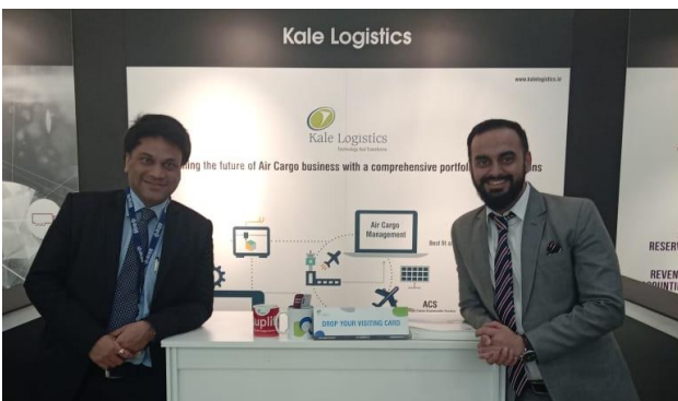
10th AIR CARGO HANDLING Brussels, Belgium 25-27 September, 2018