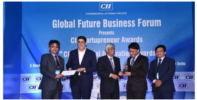
Kale Logistics Solutions awarded 'Most Innovative SME company – service category' at CII Industrial Innovation Awards 2018