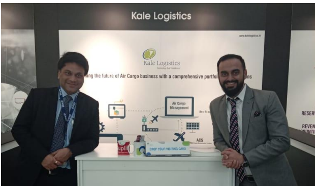
10th AIR CARGO HANDLING Brussels, Belgium 25-27 September, 2018