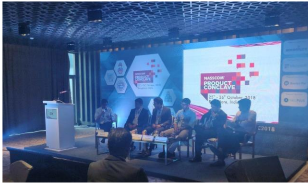
NASSCOM Product Conclave (NPC), Bengaluru, India 25-26 October, 2018