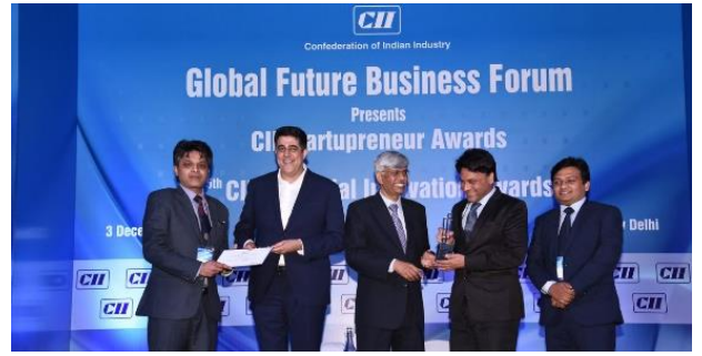
Kale Logistics Solutions awarded 'Most Innovative SME company – service category' at CII Industrial Innovation Awards 2018