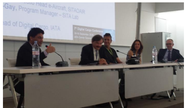
IATA 7th Digital Cargo Conference Geneva, Switzerland 18-19 September, 2018