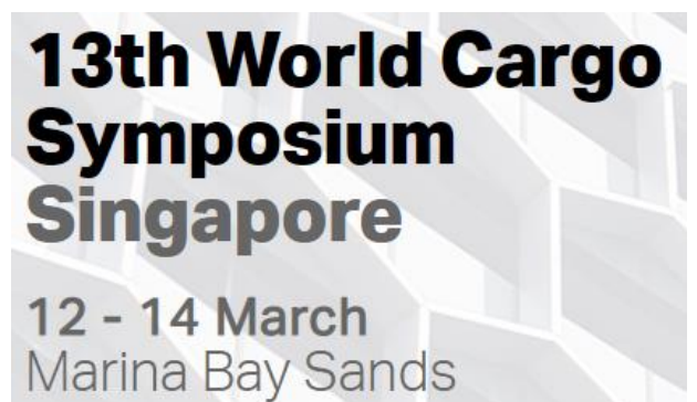
Forthcoming event: World Cargo Symposium, Singapore 12-14 March 2019