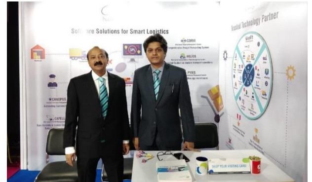
FIATA World Congress New Delhi, India 26-29 September, 2018