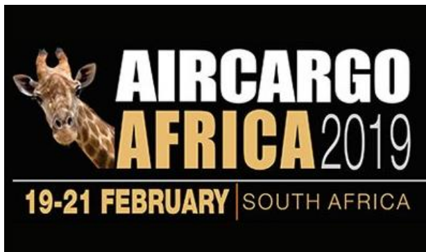
Forthcoming event: Air Cargo Africa 19-21 February 2019