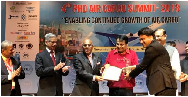
Kale Logistics Solutions felicitated for "Outstanding contribution to Logistics IT Services" at 4th PHD Air Cargo Summit 2018