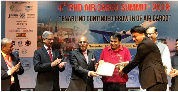
Kale Logistics Solutions felicitated for "Outstanding contribution to Logistics IT Services" at 4th PHD Air Cargo Summit 2018