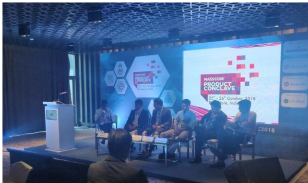
NASSCOM Product Conclave (NPC), Bengaluru, India 25-26 October, 2018