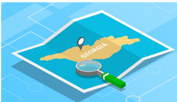
Kale Logistics Solutions opens a new office in North America to drive digital transformation for North American Logistics customers