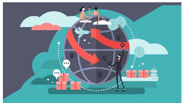
North America's first New Generation Airport Cargo Community System developed by Kale in partnership with Atlanta Air freight community and Atlanta airport goes live at Hartsfield Jackson International Airport